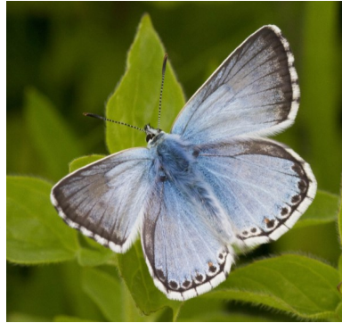
Male Chalkhill Blue at Hexton

Our branch symbol is the Chalkhill Blue as it is such an attractive butterfly and strongly associated with Hertfordshire through the colony at Therfield Heath which has been a hot spot for butterfly collectors and now watchers for many decades. All our other colonies are on chalk downland sites at Aldbury Nowers, Telegraph Hill and Hexton Chalkpit. In recent years the population at Hexton Chalk Pit has been spectacular - visit on a sunny later-July or early-August day and you will be surrounded by swarms of pale blue male butterflies. The more secretive brown females can be seen being pursued by many males as they seem to far outnumber them.