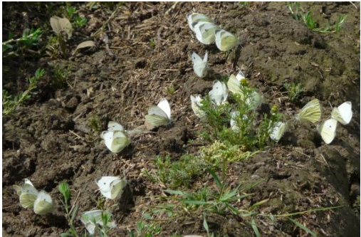
Green-veined and Small Whites mud-puddling near Patmore Heath.

In Spring the Green-veined White is attracted to bluebells and the flowers of larval food plants such as Honesty. The males of both species seem to be equally attracted to minerals in wet patches on the ground during dry weather, but at least they are then identifiable.